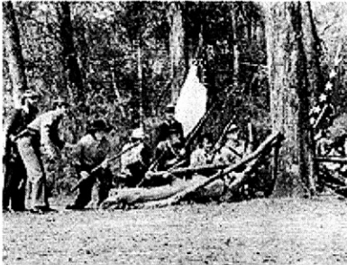
First reenactment of the battle in 1974

A ceremony honoring the combatants on both sides of the Battle of Natural Bridge, followed by a reenactment of the battle featuring Union, Confederate, and civilian reenactors, is held at the park the first weekend of March every year. The event is free and open to the public. [4]