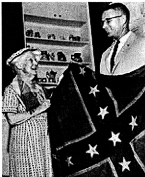
Secretary of State Tom Adams showing battle flag of Natural Bridge (1961)

The site of the battle is now Natural Bridge Battlefield State Historic Site , a Florida State Park , and contains a monument with the inscription: