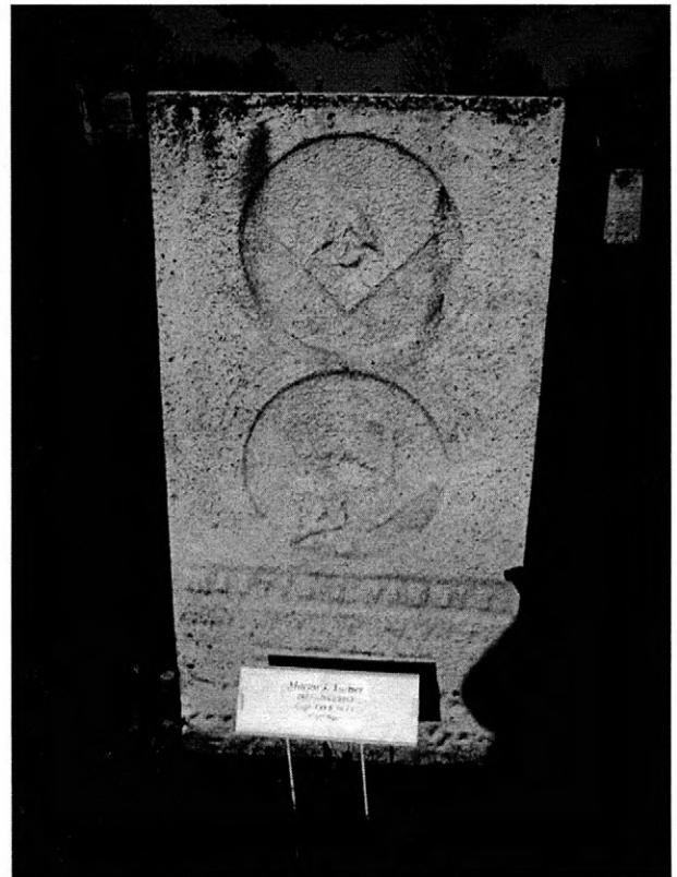
Added by: zoey