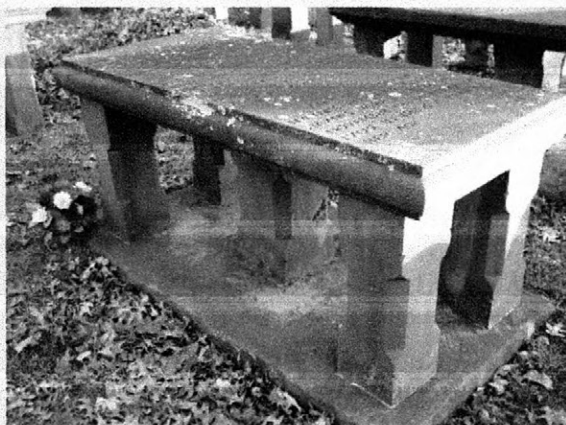
Added by: Guiding Light